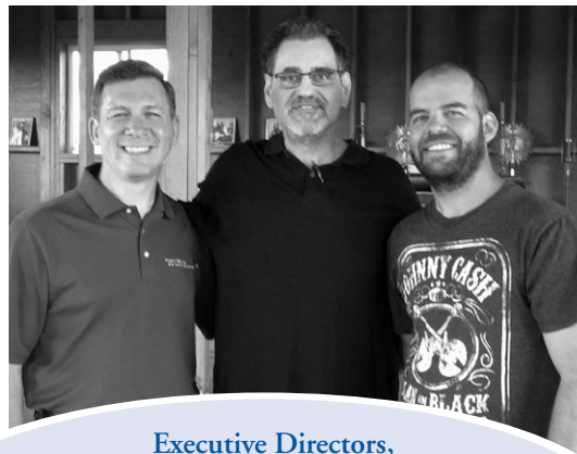
Executive Directors, past and present, together during OBT.