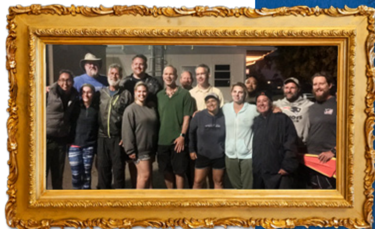
Swim For Hope, 2018

“WITHOUT OUR SPONSORS SUPPORTING EACH MILE AND OUR BOYS, OUR MINISTRY WOULD BE INCOMPLETE. WE NEED EACH OF THESE TO ACCOMPLISH OUR WORTHY MISSION.”