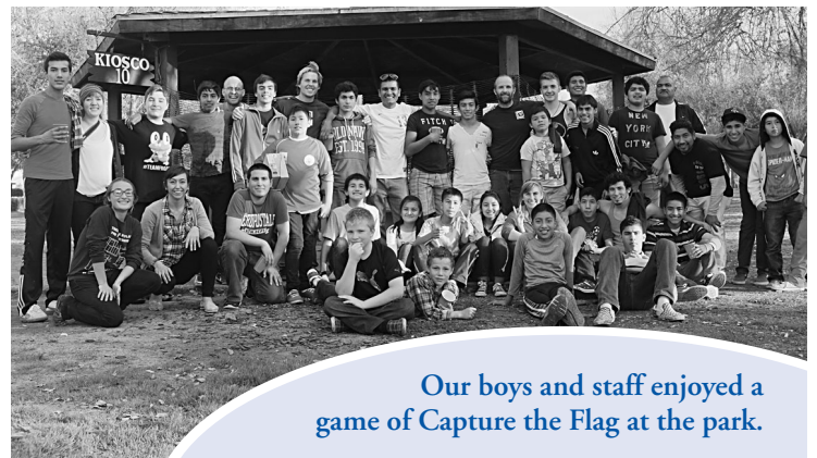
Our boys and staff enjoyed a game of Capture the Flag at the park.

We would like to offer our deepest thanks to The Order of St. Ignatius of Antioch for its generous 2014 grant. The Order has been faithfully supporting the work of our ministry for over 20 years and we are extremely grateful to its guiding hierarchs, generous members, and dedicated Board of Directors. May God continue to multiply all the amazing work of The Order, in the Church and the whole world.